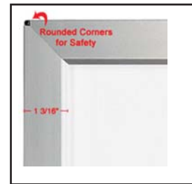
Round corners for safety