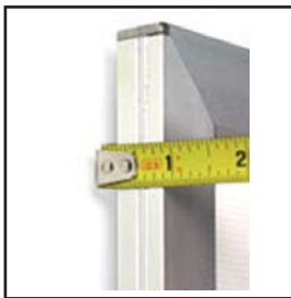
as thin as 0.86" in thickness

ULTRA Thin ENERGY Saving UNIFORM brightness